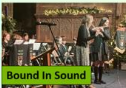
Bound In Sound