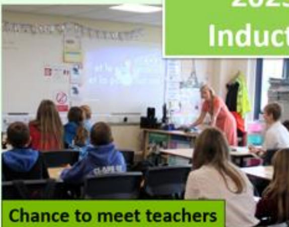
Chance to meet teachers