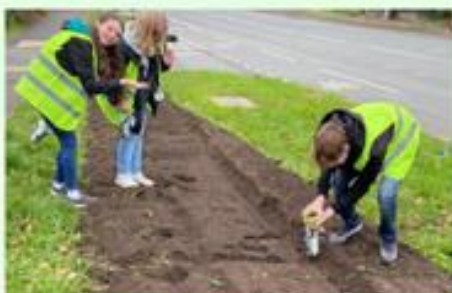
Daffodil Re-planting Along The Golden Mile