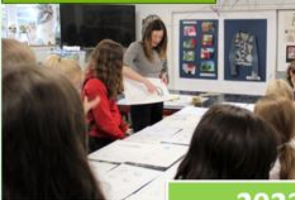
Chance to taste lessons