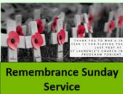
Remembrance Sunday Service