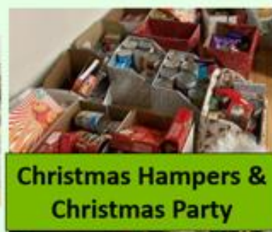
Christmas Hampers & Christmas Party