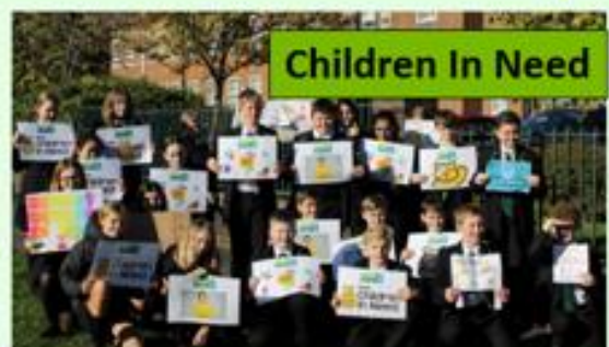
Children In Need