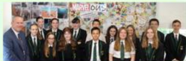
Weaver Words Poetry Competition