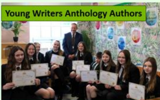
Young Writers Anthology Authors