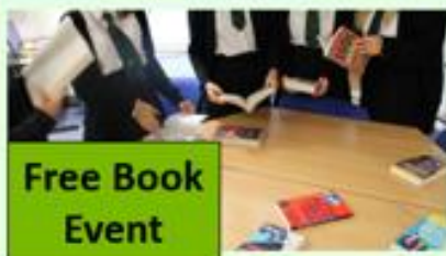
Free Book Event