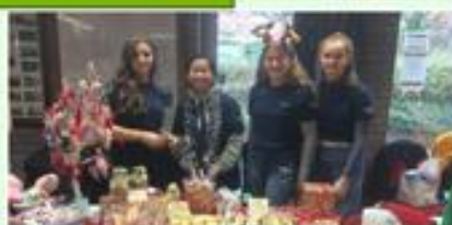
Helping At 'Ho Ho Helsby'