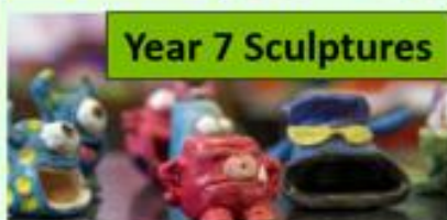
Year 7 Sculptures