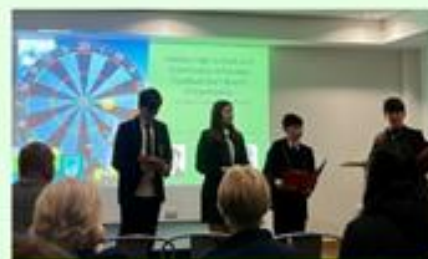
Helsby Parish Council Grant Show