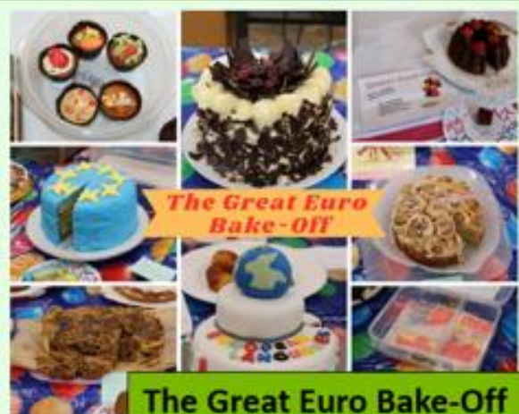
The Great Euro Bake-Off