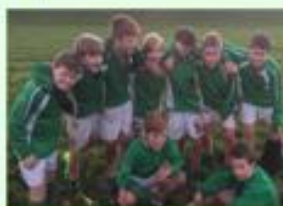
Year 7 Sports Teams