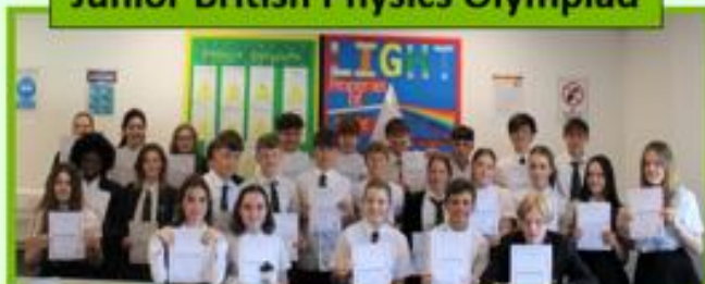
Junior British Physics Olympiad