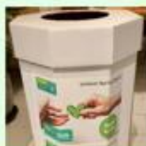
School Uniform Share